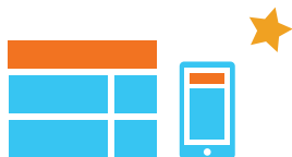
Premium Header Desktop & Mobile